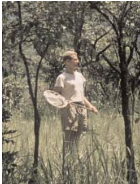
A young Robin showing proper form for insect collecting in Africa.